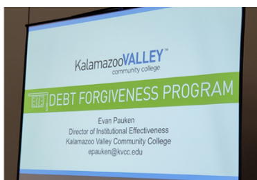
Colleagues Attend DREAM Conference